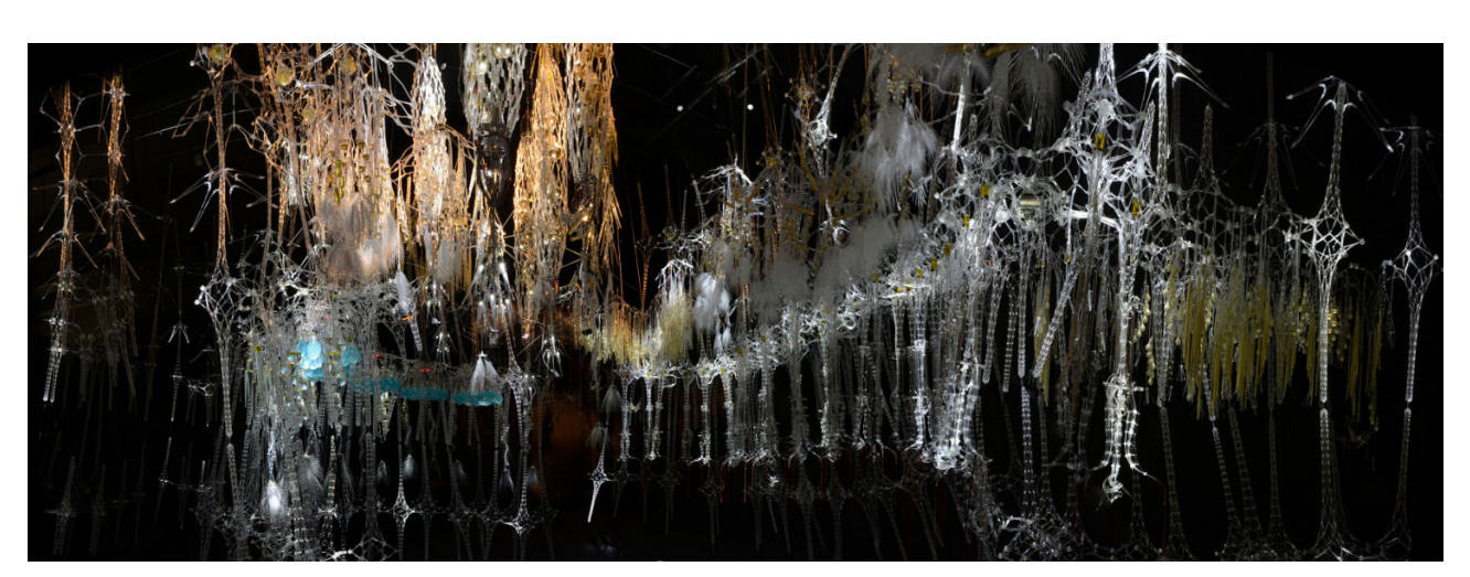
7 Epiphyte Chamber, installation view. Museum of Modern and Contemporary Art. Seoul, Korea - 2013.