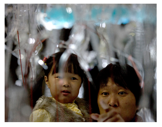
{\bf 3}\; Epiphyte Chamber, installation view. Museum of Modern and Contemporary Art. Seoul, Korea - 2013.