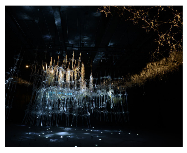
4 Epiphyte Chamber, installation view. Museum of Modern and Contemporary Art. Seoul, Korea - 2013.