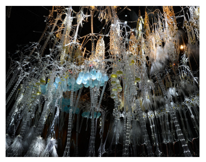
5 Epiphyte Chamber, installation view. Museum of Modern and Contemporary Art. Seoul, Korea - 2013.