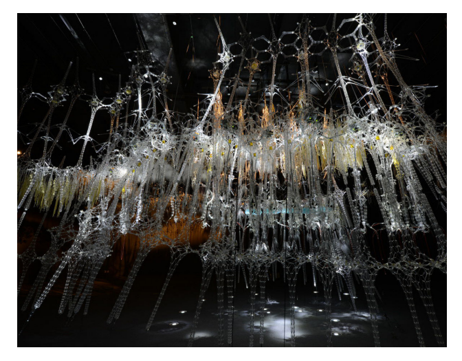
9 Epiphyte Chamber, installation view. Museum of Modern and Contemporary Art. Seoul, Korea - 2013.