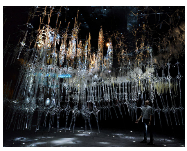
13 Epiphyte Chamber, installation view. Museum of Modern and Contemporary Art. Seoul, Korea - 2013.