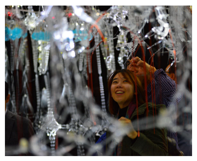
12 Epiphyte Chamber, installation view. Museum of Modern and Contemporary Art. Seoul, Korea - 2013.