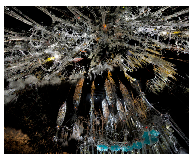
10 Epiphyte Chamber, installation view. Museum of Modern and Contemporary Art. Seoul, Korea - 2013.