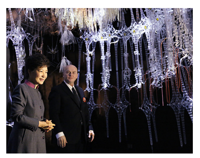
11 Epiphyte Chamber, installation view. Museum of Modern and Contemporary Art. Seoul, Korea - 2013.