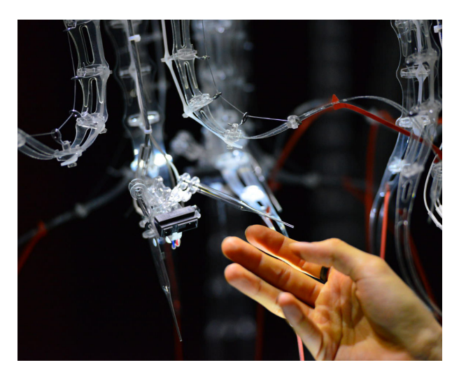
6 Epiphyte Chamber, installation view. Museum of Modern and Contemporary Art. Seoul, Korea - 2013.